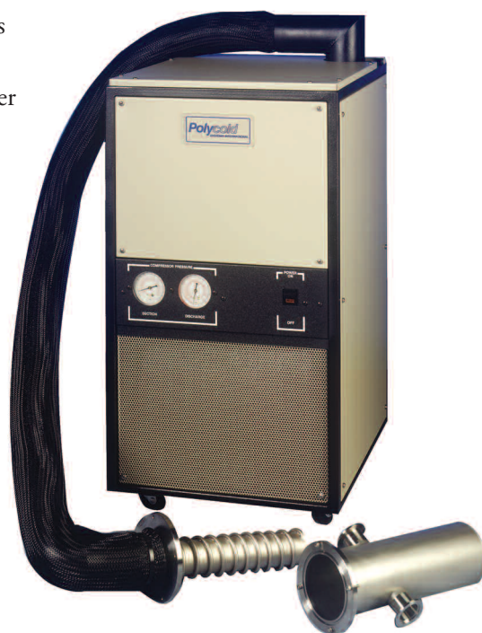
The P-100 with Cold Probe